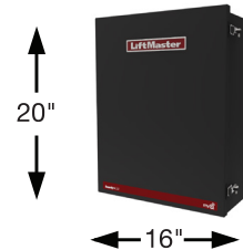
XLSOLARCONTDC Extra Large Control Box

* Basic set up with remotes programmed. Does not include added accessory power draw. LiftMaster low power draw accessories recommended to extend cycles and standby time on battery backup.