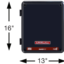
LA400CONTDC Standard Control Box