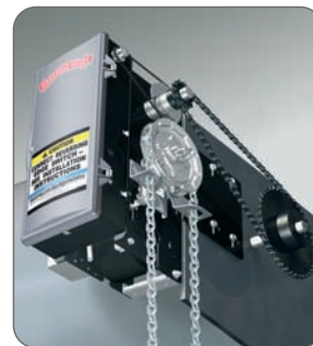
RMX™ Jackshaft with and without Hoist – Rolling Service