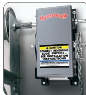
RMX™ Jackshaft with and without Hoist – Sectional Door