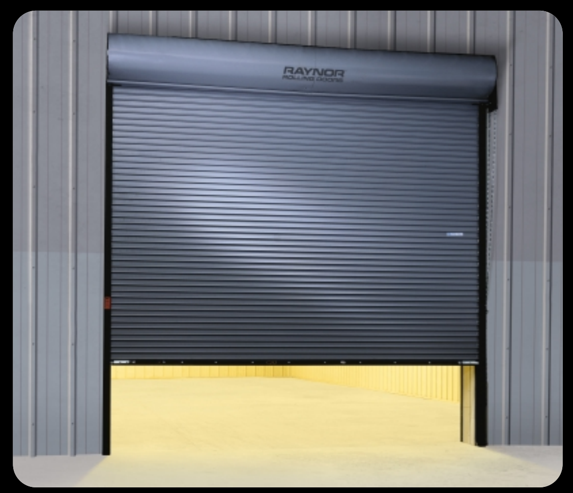
DuraCoil OPTIMA, gray, with flat steel slats