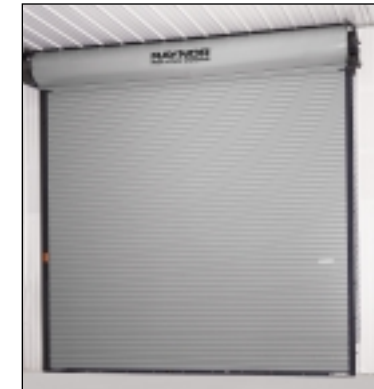
DuraCoil STANDARD, gray, with flat steel slats

When facility design or environment requires unique materials, this model is offered exclusively with aluminum or stainless steel slats and options to meet specific design performance.