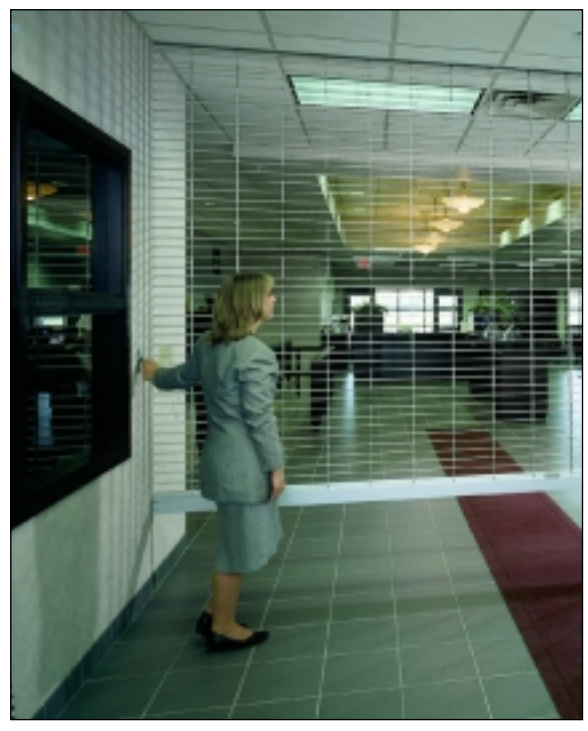
DuraGrille STANDARD, straight pattern

When security and visibility are primary considerations, choose our attractive rolling DuraGrille STANDARD security grille. The grille pattern, available in straight or brick, offers an unobstructed view of displays and merchandise. DuraGrille security grilles offer protection against theft and vandalism — all with a contemporary look.