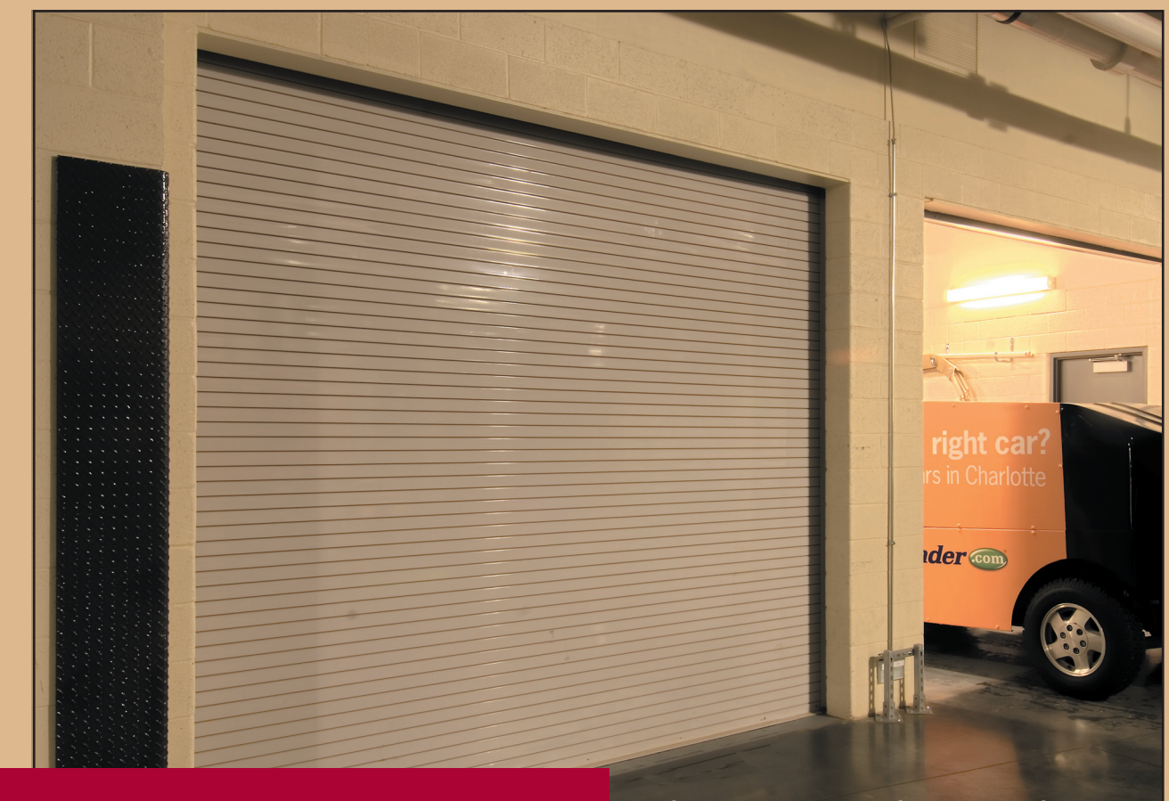
Charlotte Bobcats Arena - Charlotte, North Carolina